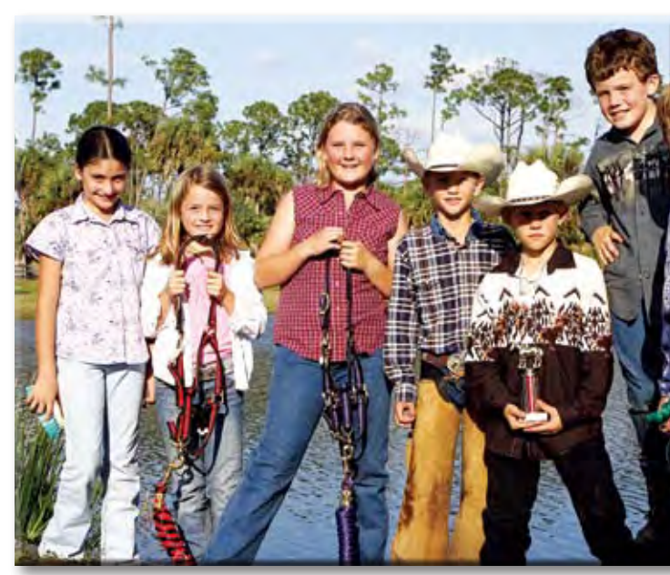
Youth winners at the Linked D Ranch Sorting.

Here in "sunny south Florida," we are going from bragging about the weather to whining about it! The last couple of shows have been so hot that we had to rotate the herds every four to five teams for the open classes!